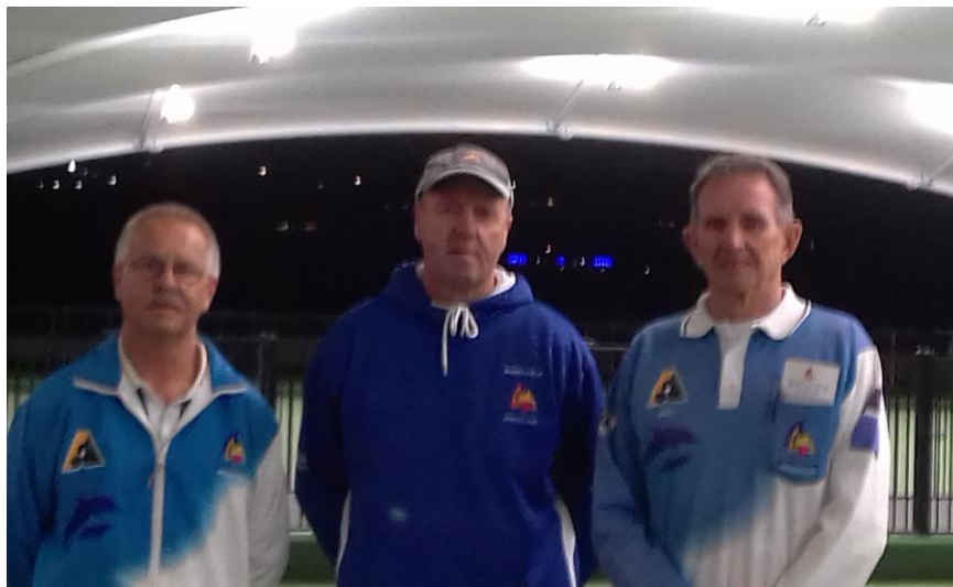
2017 Club Triples Championship Runners Up