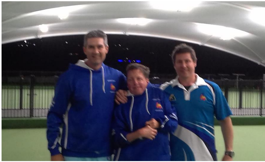
2017 Club Triples Championship Winners